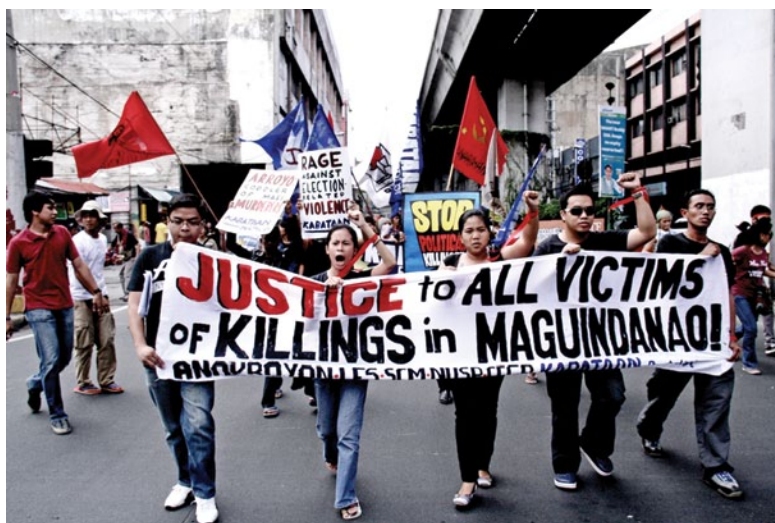
Youth Protest Against Ampatuan Massacre, 26 November 2009.

In 2010 Mindanao Peaceweavers published a Mindanao Peoples' Peace Agenda, based on dialogue and consultations with multiple local constituencies. 59 The document offers policy suggestions and serves as a roadmap for overcoming violence, injustice, and oppression in the region. It affirms the right of self-determination and highlights the need for human rights,