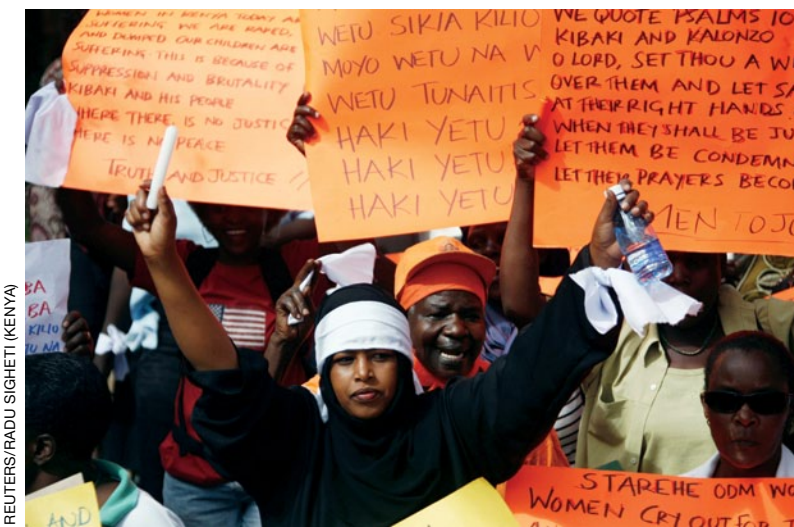
REUTERS/RADU SIGHETI (KENYA)

Civil society groups played an important role in facilitating and encouraging the post-election settlement mediated by former UN Secretary-General Kofi Annan in 2008 in which Kibaki and Odinga agreed to rule