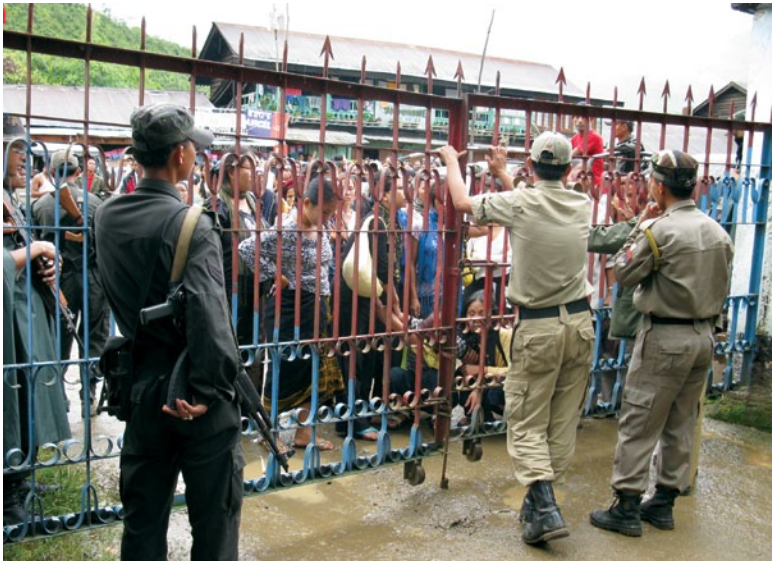
Women's protest against excessive army violence in Imphal, Manipur.

incidents of unlawful arrest, torture, and extrajudicial killing.