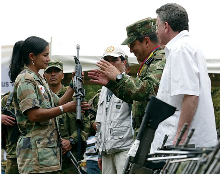
Colombian rebels of the ERG surrender their weapons in El Carmen de Atrato Choco Province, 21 August 2008.

Members of the Colombian armed forces have been investigated recently for killing unarmed civilians and covering up the crimes by claiming that the deceased were guerillas killed in a firefight. The civilian intelligence service was shut down in September 2010 for colluding with paramilitaries in spying on judges, opposition politicians, journalists, and human rights defenders. More than eighty members of the Colombian Congress, many of them members of the ruling coalition, have been jailed or placed under investigation for ties with paramilitary groups. 36