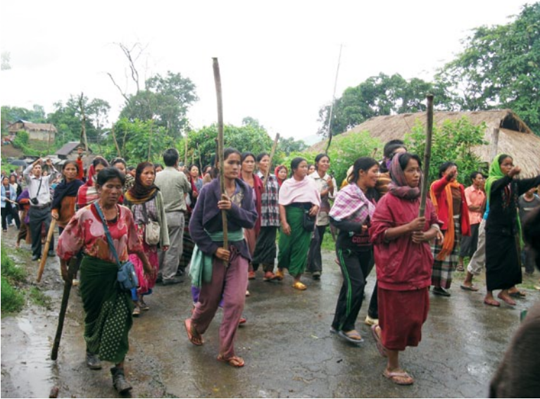
Gwaltabi, Manipur. On 7 September 2009 security troops ambushed a pickup truck and executed five passengers. “Rebels” according to the army, “civilians” according to the demonstrators. Out of protest these women blockade the road the army frequently uses.

Latin America, and Africa and is based on interviews and meetings with hundreds of representatives of civil society organizations (CSOs), donor agencies, research centers, and governments. It benefits especially from the work of CIVICUS, the International Center for Not-for-Profit Law, and the Charity and Security Network. The purpose of the report is to examine the impact of CTMs on local development and human rights activities and to identify appropriate government, intergovernmental, and nongovernmental responses.